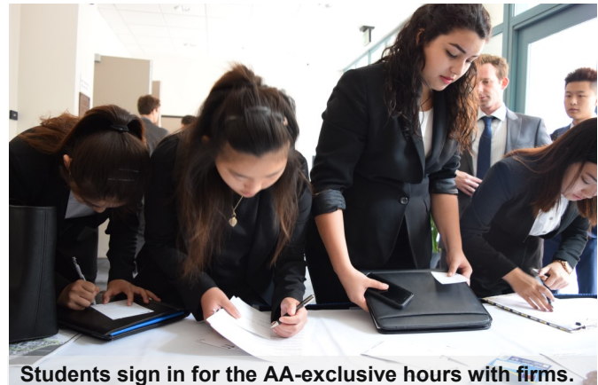
Students sign in for the AA-exclusive hours with firms.