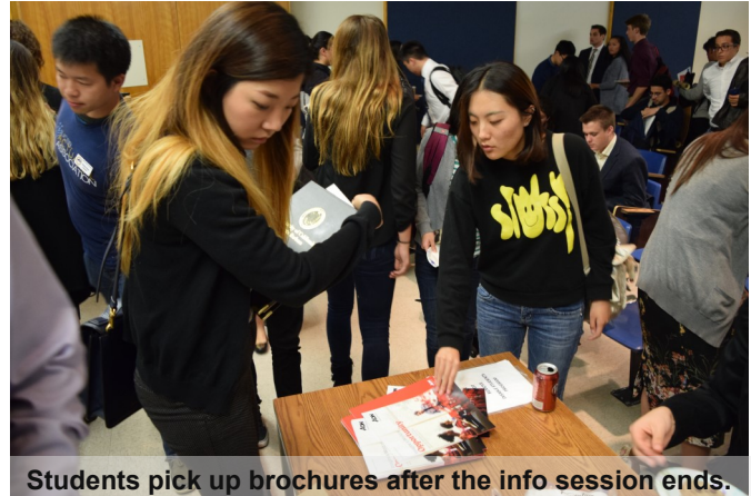
Students pick up brochures after the info session ends.