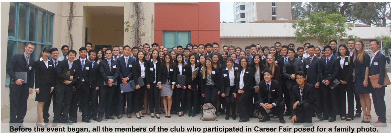
Before the event began, all the members of the club who participated in Career Fair posed for a family photo.