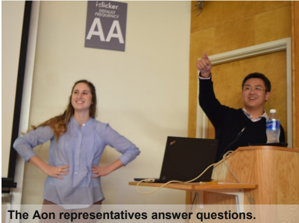
The Aon representatives answer questions.

Two representatives from Aon paid a visit on Wednesday 12, a day before they set up shop at the Career Fair. The discussion centered primarily on the intricacies of the profession and the day-to-day life of an actuary.