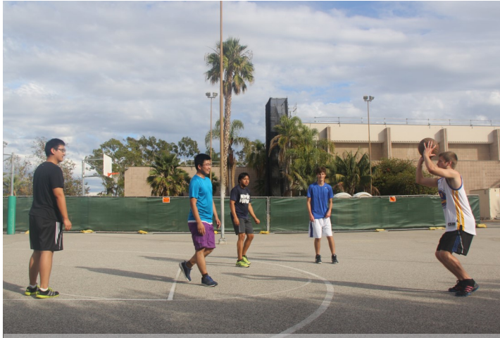
A player pulls up for an uncontested, but deep three pointer.

Students took time from their Saturday afternoon to get in exercise, meet new members and showcase their basketball ability in a series of 3-on-3 blacktop matches.