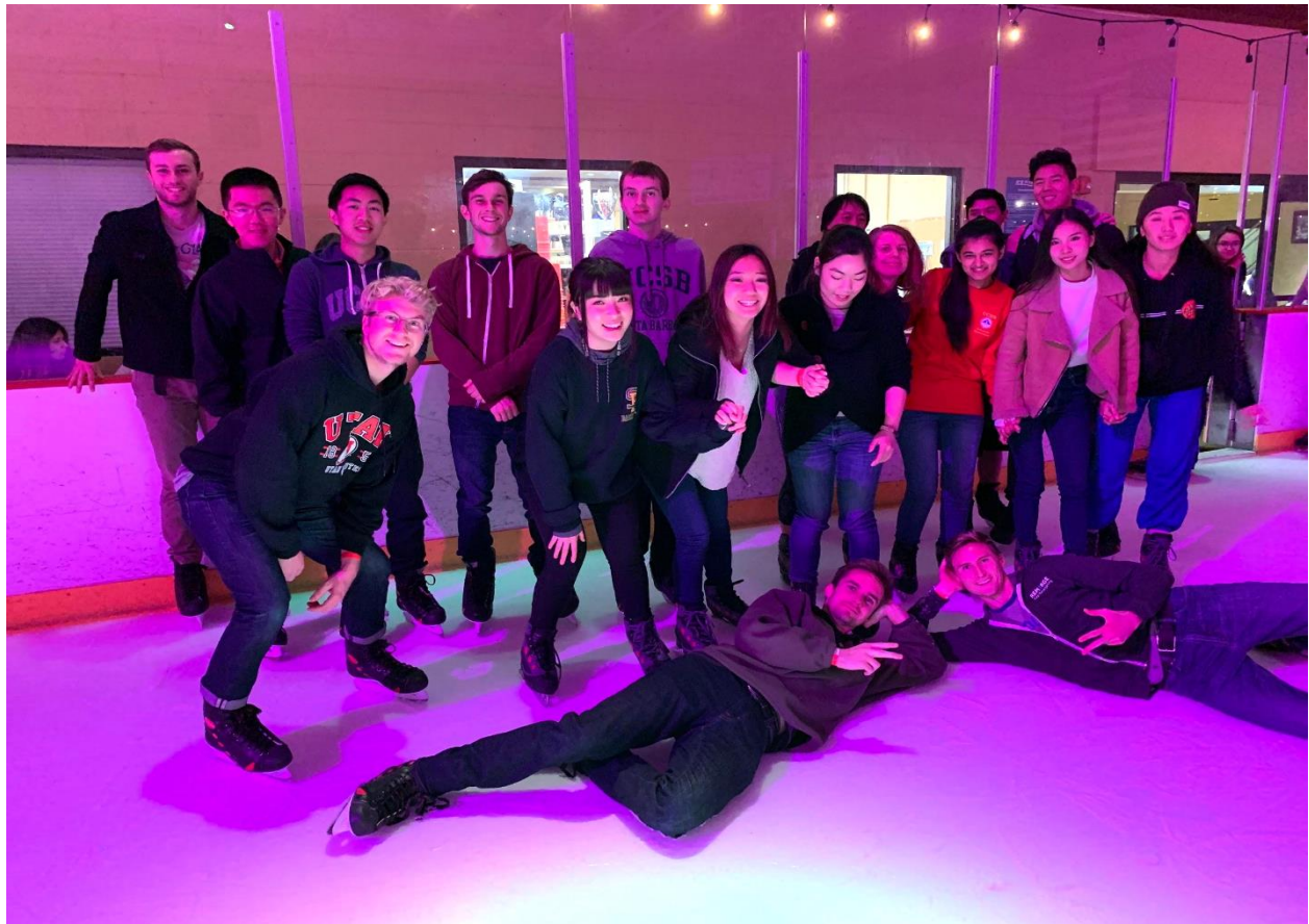
Pictured: Actuaries on Ice! January 26, 2019.